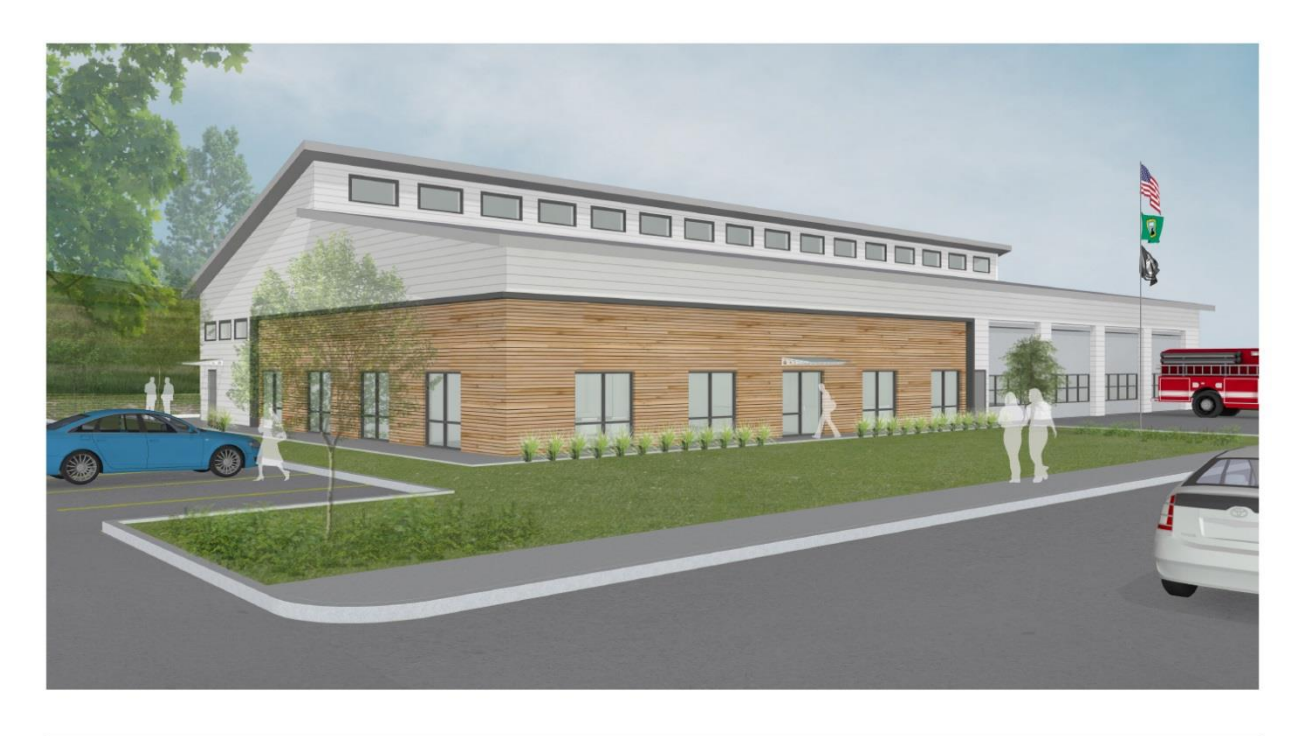
City of Stevenson | Stevenson Fire Department